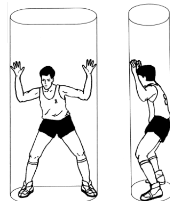
Diagram 5 Cylinder principle

Consistency within a game is something that an official will improve with experience, and exposure to more game situations. Coupled with the increased teamwork requirements of these officials, they must maintain this call pattern within the officiating team on court.