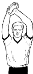
Grasp wrist upward

Decisiveness requires the referee to identify what is going to happen, or what just happened in a game, and react accordingly. Referees need to anticipate the play but not the call. They can identify problems before they appear, enabling them to proactively prevent a situation, or deal with it effectively when it does occur.